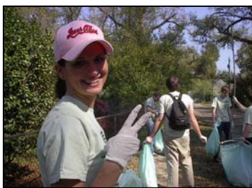
Great American Clean-up