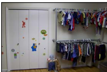
The HOPE Closet