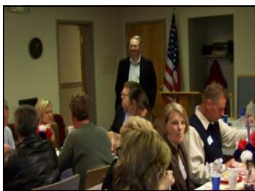
HOPE Center Council meeting, Spring 2009